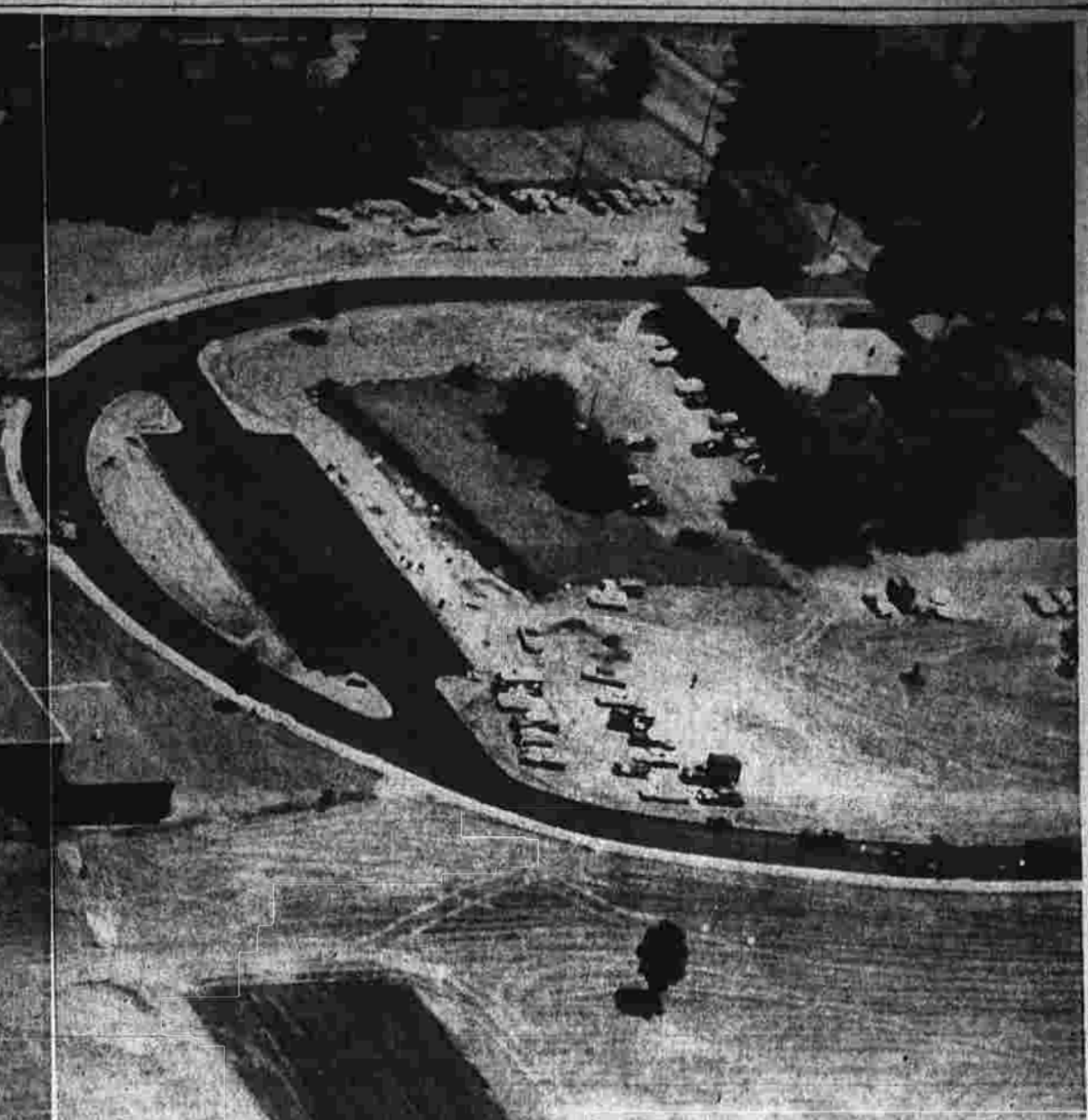
Grading and amesiting at North End junior high school put a finishing touch on the project, due to open in September. Furniture is being installed.