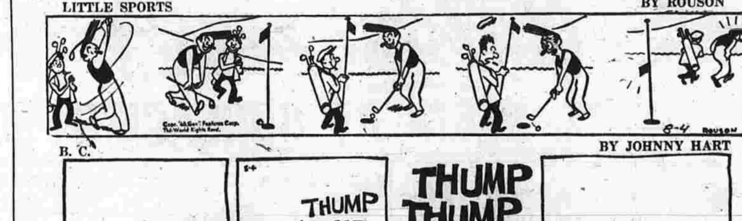
LITTLE SPORTS BY ROUSON