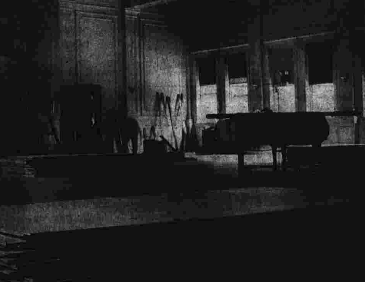
Beams for East Catholic High School are in place, wiring and heating lines are going in, beams are rising. Piles of plywood for a new floor in the Barnard auditorium third floor wait for the workmen.